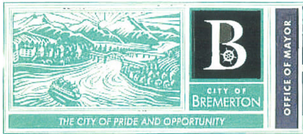
Mayor Cary Bozeman

cary.bozeman@ci.bremerton.wa.us Tel 360-473-5266 Fax 360-473-5883 345 6th Street, Suite 600 Bremerton, WA 98337-1873